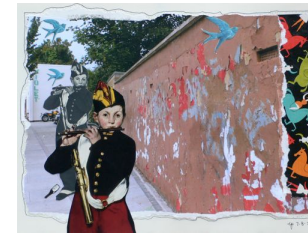
A day in June, a fifer