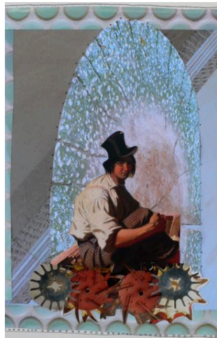
Table, top hat, gears