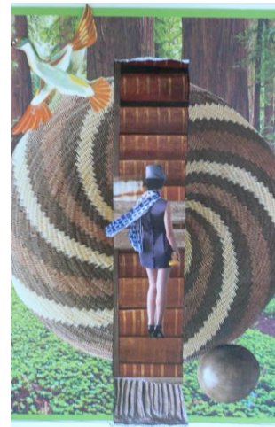
You'll love flying